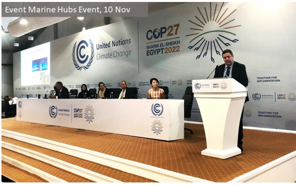
Event Marine Hubs Event, 10 Nov