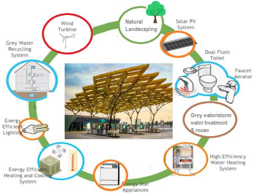
Energy Conservation initiatives at ENOC Futuristic Station at Expo 2020