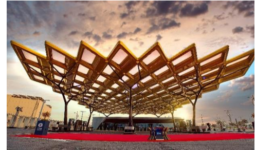
ENOC Futuristic Station Expo 2020

ENOC Retail futuristic station opened with smart energy efficient technologies in Expo 2020 Dubai, complying with the ISO 50001 standard and certified by LEED Platinum certification in January 2021