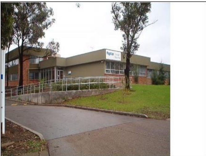
Scott Safety and Tyco Projects Guildford. The first Tyco site globally to achieve ISO50001.