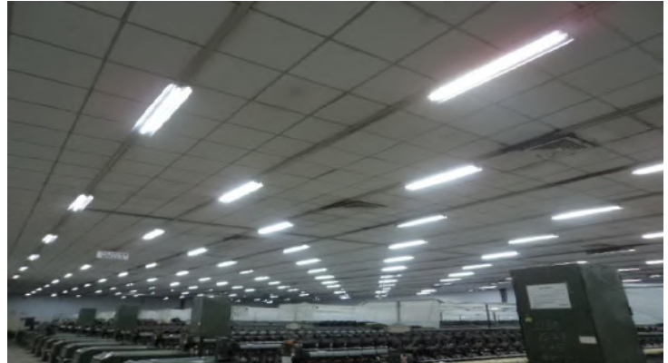
LED tube lights at Worsted spinning Department.