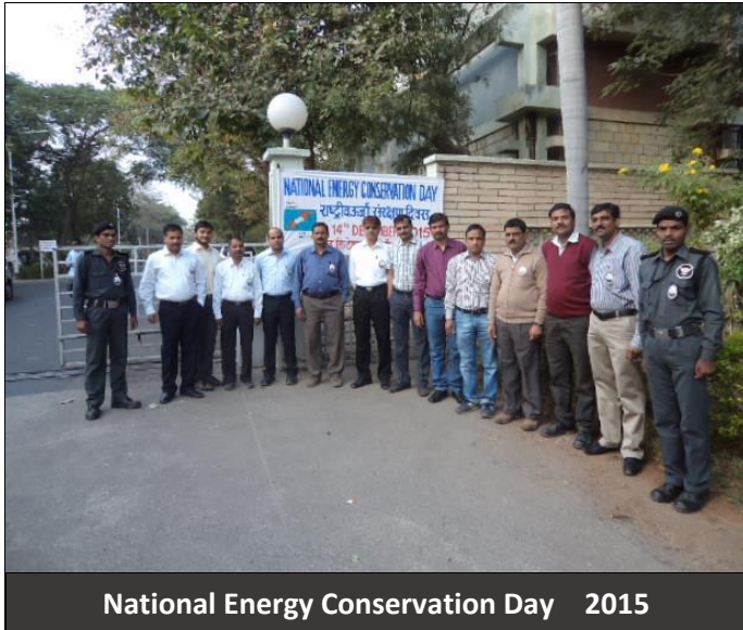
National Energy Conservation Day 2015