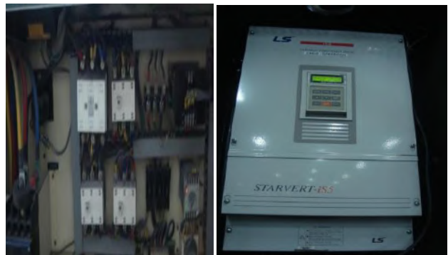
Installation of inverters in place of star delta starter