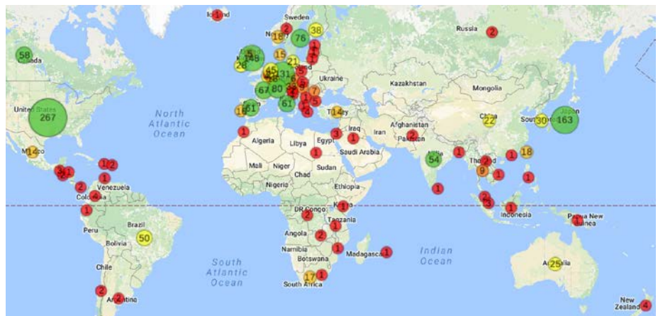
Figure 1. Location of off-site RE projects purchased by companies reporting to the Carbon Disclosure Project (CDP). Green >50, yellow = 20-50, orange = 5-20, red = 1-5 projects. Data source: CDP; Map source: Espatial