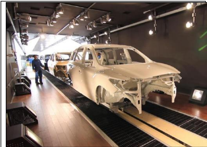
Nissan's vehicle assembly plant in Smyrna, Tennessee, is the first U.S. passenger vehicle plant to achieve ISO 50001 and U.S. Superior Energy Performance (SEP) certification.

Automaker improves energy performance 25% over Six Years with SEP