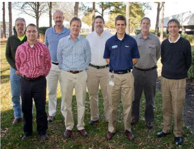
Members of the Nissan North America Energy Team at the Smyrna, TN facility.

Nissan's Energy Team, with support from the plant's Facilities Engineering department, modeled the EnMS after its existing management system for the environment (ISO 14001).