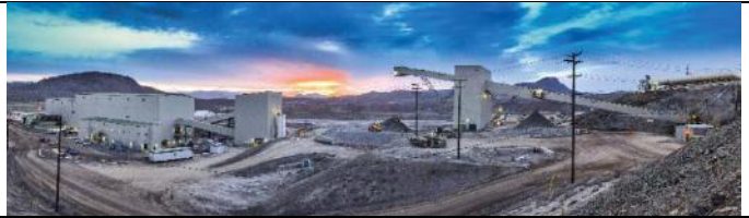
Sunrise at New Afton Mine

New Afton is the first mine in North America to implement ISO 50001.