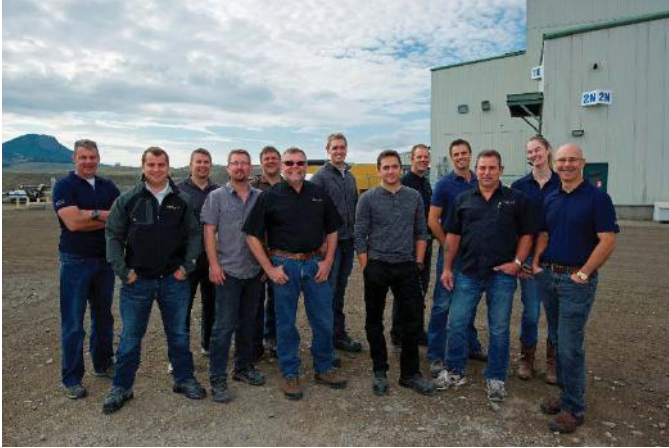
Figure 1. ISO 50001 Implementation Energy Team

planning process and are part of the Top Management performance contracts.