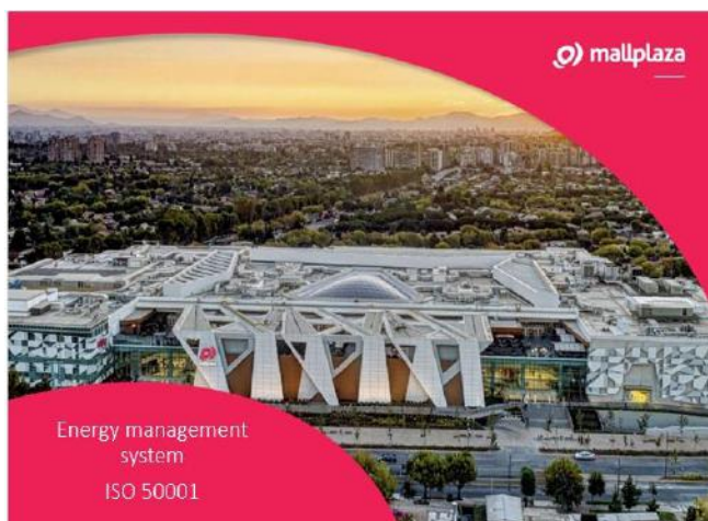
Image 1: Plaza S.A.