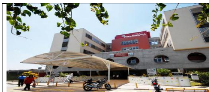
Pirajussara General Hospital

Third Brazilian public hospital certified to ISO 50001