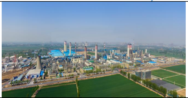
XLX Corporation Aerial View

XLX formed a long-term mechanism of systematic energy saving through the EnMS project and achieved economic benefits of USD 37.5 million in 5 years.