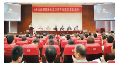
Figure1 Carbon Emissions Demonstration Project Training Sessions