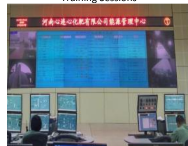
Figure2 Energy Management Center