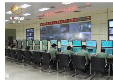
Figure3 Production Dispatch Center

The corporation had set up a leading group for energy conservation and carbon reduction at the company level, established an energy management center, built an energy management system, implemented demonstration projects of the energy management center, and continuously improved energy management through technological innovation and QC tackling key problems. XLX has currently formed a systematic, standardized, standardized, visual energy management model with all the staff participating in energy saving.