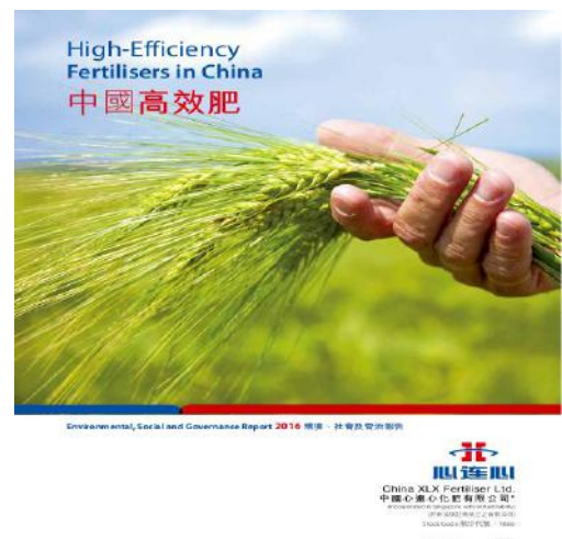
Figure4 Environmental, Social and Governance Report

Xinlianxin Shenleng Energy Co., Ltd is the first enterprise in Henan province to conduct carbon capture, utilization and storage (CCUS). The corporation is the first listed company in Henan province to disclose "greenhouse gas emission" information. The 2016 environmental, social and governance report released by XLX covered greenhouse gas emissions and has been disclosed to the whole society on the Hong Kong stock exchange. As the first carbon emission management demonstration enterprise, the corporation held the signing ceremony and training meeting of the national carbon emission management demonstration project in 2017, becoming the first carbon emission management demonstration enterprise in Henan province.