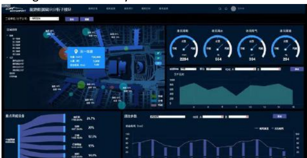
Figure 8 The digital energy management system

③ Install digital energy management system to ensure real-time statistics and energy use analysis, monitor the operation of energy equipment, and improve energy management efficiency.