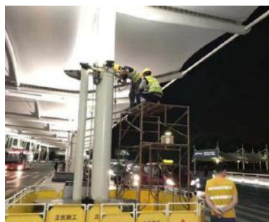
Figure 3 projects with capital investment