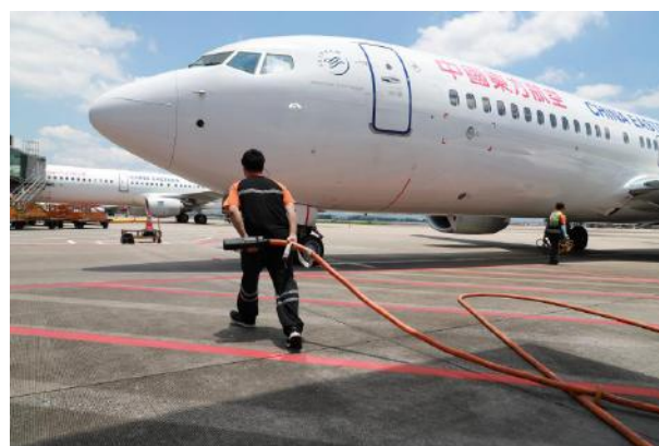
Figure 5 Using APU replacement facilities