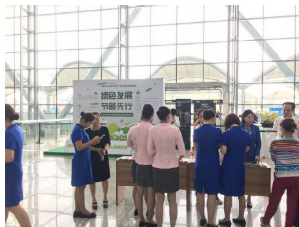
Figure 7 Energy conservation campaign in 2019

④ Organize the internal audit and management review activities, find the nonconformity and correct it in time.