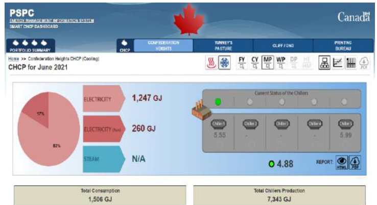
Figure 1 – Overview of the EMIS Dashboard for Confederation Heights CHCP

Implementation of the EnMS brought the challenge of metering accuracy and reliability to the forefront. A focus on reliable metering was a great asset to PSPC in structuring its P3 agreement. Operations by the P3 have resulted in more precise monitoring of energy use and, as a result, more reliable invoicing of clients for energy use. In addition, the frequent dialogue and working relationships formed for ISO 50001 between PSPC and the P3 have been very beneficial to non-energy activities and improving the overall business efficiency of ESAP due to the streamlining of other processes. As a result of the communication and strong working relationship, a culture of energy performance is emerging amongst personnel of both PSPC and the P3.