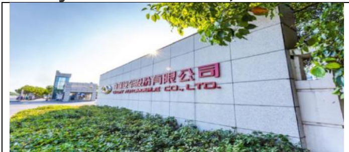
Chery Automobile research institute