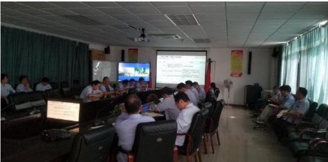
FIG.5 Objective evaluation session

Through CPS(Chery Production System)/TPM(Total Productive Maintenance) activities, the company stimulates the enthusiasm of all the employees for energy conservation, and rewards participants in proportion to the benefits of projects which feature greater energy conservation benefits and promotional significance, so as to promote full participation in the energy conservation in their own positions.