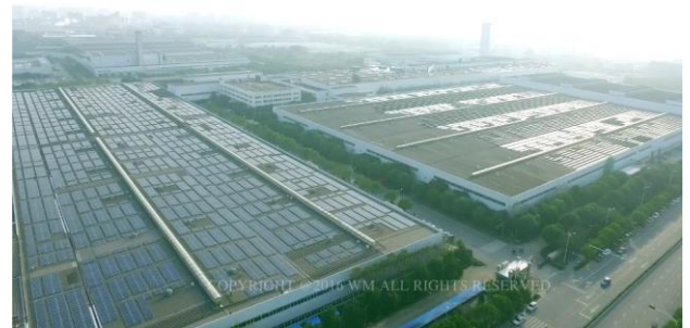
FIG.3 Photovoltaic system

Through the comparison of energy performance before and after the implementation of energy saving measures, the energy consumption per unit product of the company was reduced by 3% (115.43kgce/ unit in 2018 and 112.46kgce/ unit in 2019) to save energy 32862(GJ) and reduce carbon dioxide 3,700.33 (metric tons) annually, achieving the annual energy saving target (target 31327 GJ ) and showing a declining trend year by year.