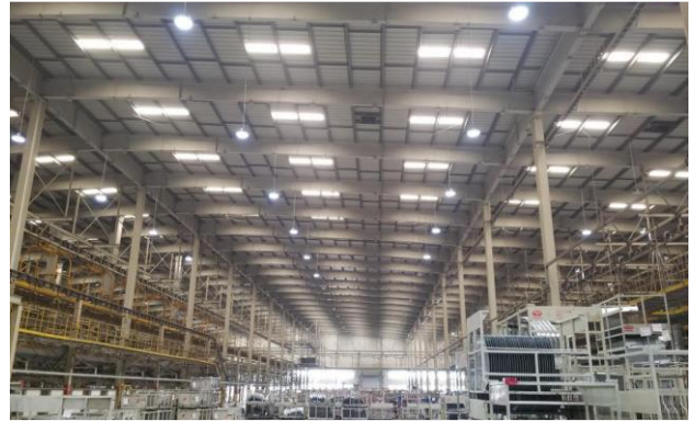
FIG.2 LED lighting system