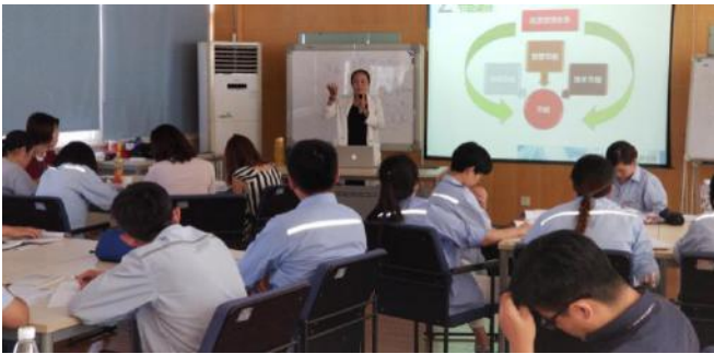
FIG.6 Training for ISO50001

organized to participate in a series training of “the Required Courses of Energy Management”; in November, the company participated in the specific training organized by the energy conservation association of the auto industry. Through the above-mentioned training, the energy management personnel improved their competence and obtained the relevant qualifications.