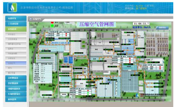
FIG.7 Energy Monitoring Center

In terms of measuring instruments, a total of 37 meters have been provided to the major units that use energy, including 13 natural gas flowmeters, 3 steam flowmeters, 6 electricity meters and 15 water electromagnetic flowmeters. A total of 327 meters are provided to the main secondary energy using units, including 12 steam flowmeters, 215 electricity meters, 59 water meters and 41 compressed air meters. The company has been equipped with 54 pieces of the main energy-using equipment, including 1 electronic belt scale, 1 natural gas flowmeter, 9 steam flowmeters, 25 electricity meters and 18 water meters. The equipping rate of meters at the major and secondary energy-using units levels has achieved 100%. The energy plant has been equipped with 45 portable infrared thermometers. The energy and environmental protection section has been equipped with a set of tap water pipe network leak detector to test the leakage of tap water pipe network.