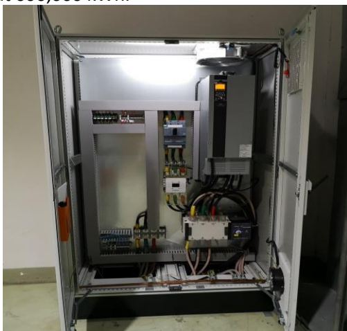
FIG.1 Air conditioning inverter system