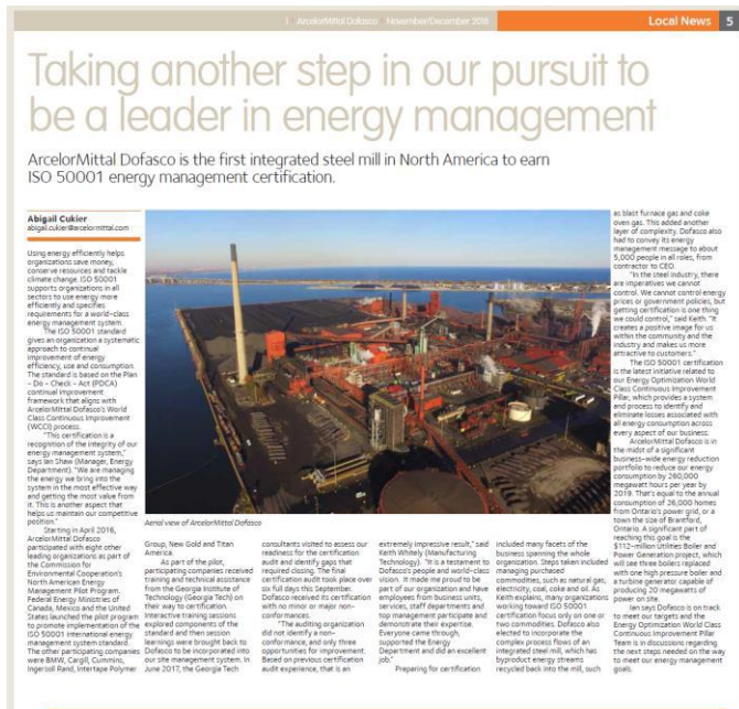
Figure 2 – Letting the public know!

In retrospect, the journey towards ISO 50001 certification was rewarding and insightful. However, the one true wish would be to begin the implementation journey sooner. With certification to ISO 50001 complete, the future of energy performance improvement at ArcelorMittal Dofasco can now take on another interpretation, one where the day will not be judged by the harvest we reap, but by the seeds that we plant.