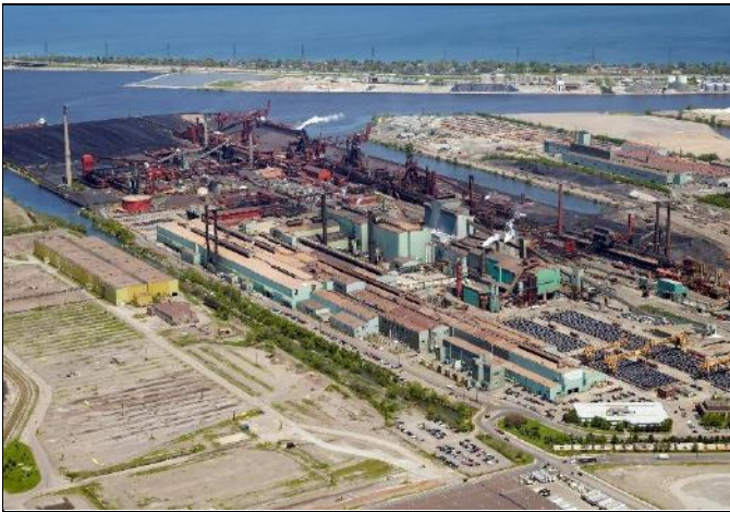
ArcelorMittal Dofasco located in Hamilton, Ont.

The first ISO 50001 certified integrated steel producer in North and South America.