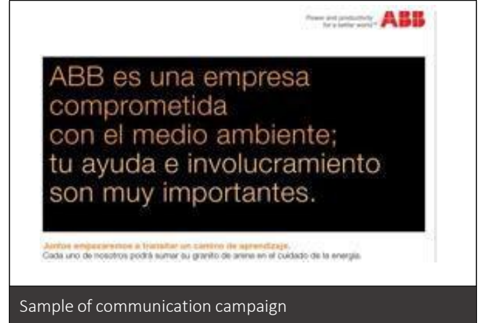
Sample of communication campaign

Nomination of management representative as well as the authorization to gather EnMS team across the organization took place during said Management Team meeting.