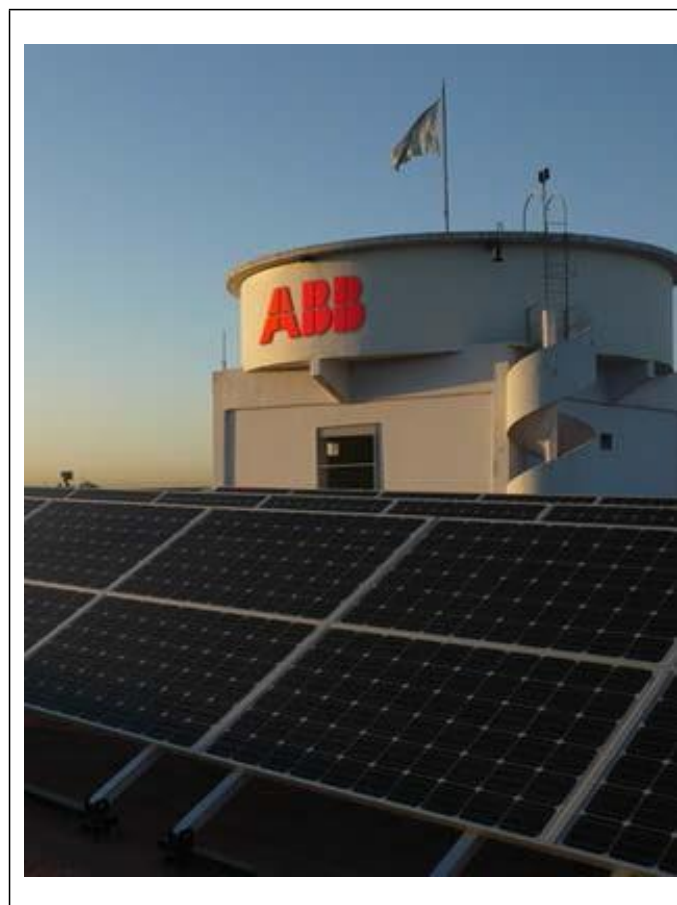
Solar panels in the rooftop of Valentin Alsina facilities

ABB Argentina, Valentin Alsina facilities.