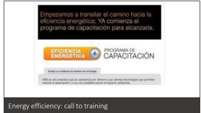
Energy efficiency: call to training

The main costs during implementation of the system were related to training.