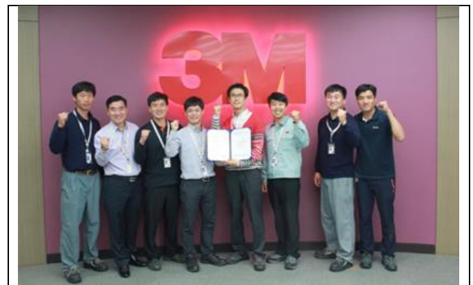
3M Korea Naju Energy Team

The Naju energy team have carried out from metering and performing projects to employee education