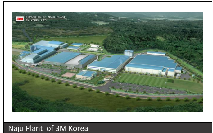
Naju Plant of 3M Korea

3M Company has a long history of caring for the environment. 3M Korea also has made our effort to contribute to 3M strategic objectives. In 2015, 3M Korea Naju plant, one of 3M international subsidiary, had worked with KEA (Korea Energy Agency), to implement energy management system. Naju plant obtained certification of the ISO50001, global EnMS standard and is the first company in Korea achieved Superior Energy performance (SEP) from KEA. Naju plant's EnMS implementation enable 7.14 percent improvement in energy performance in 2 years.